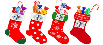
Year Round Stocking Stuffer Project

There is a box wrapped with Christmas paper in the overflow area where you can drop off your donations each month. You always have the option for a financial donation as well. Please see Kay for more details.